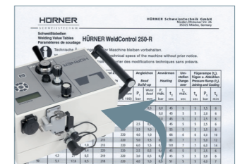
WeldControl jointing – no errors, no welding parameter look-up, but data recording