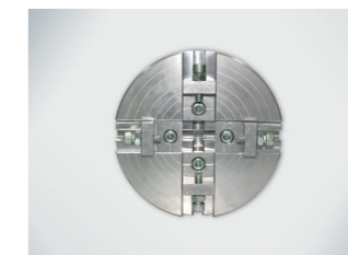
Welding neck support