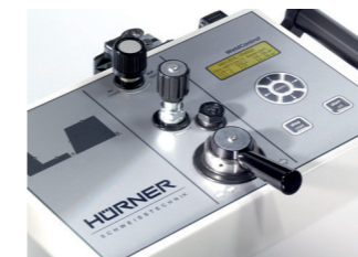
Front panel with GT keypad